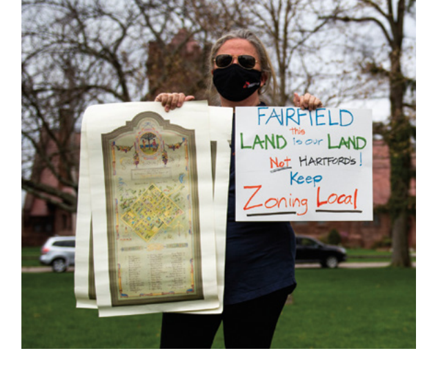
Municipal associations, local leaders, and residents have pushed back against statewide zoning reform efforts. Here, a protester in Connecticut urges lawmakers to "keep zoning local."

Reformers aspire to dig deeper on the issue of process, which has been shown to hinder and discourage new development by making it