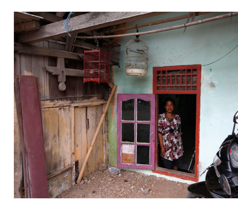
In Java, Indonesia, a resident stands by a window that now serves as a door in a house affected by land subsidence.

The absence of climate action—in cases when municipalities can't or won't implement resilience infrastructure and other measures to halt flooding, sea-level rise, mudslides, and the like—drives down values precipitously.