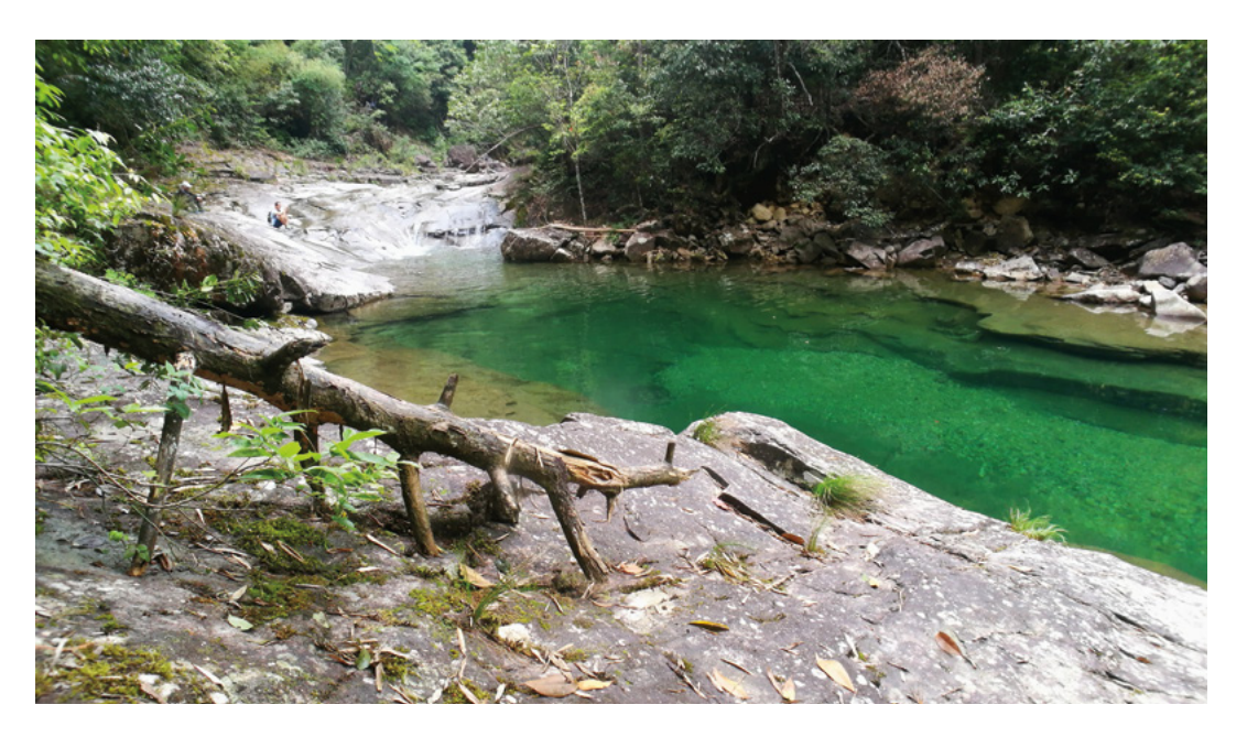
The Park Service of Baishanzu pilot national park is evaluating the potential of using a tool similar to conservation easements to protect resources at the park, located in Zhejiang Province.

TNC China and the Paradise Foundation are working with the Institutes of Science and Development, a high-level national think tank affiliated with the Chinese Academy of Sciences, to explore how non-governmental stakeholders, including local communities, NGOs, the business sector, and the public, might better participate in protected area planning and management.