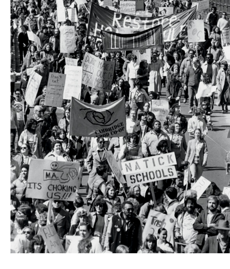
Demonstrators took to the streets in 1981 to march against Proposition 2½, which capped the property tax in Massachusetts.

The updated assessments have had other positive effects as well. In 1992, more than 12,000 assessment appeals were taken to state court, and the city had to set aside more than 6 percent of its property tax revenue to pay