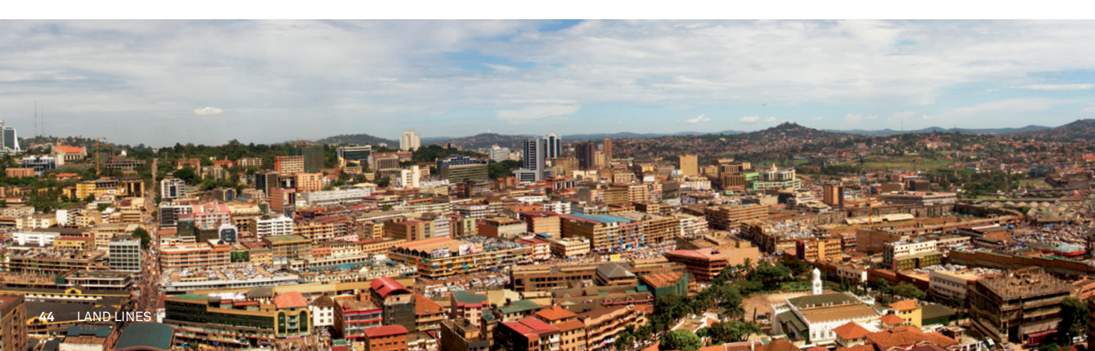
Home to 1.7 million people, Kampala, Uganda, is one of the fastest-growing cities in Africa. Rapid urbanization has put a strain on the city's financial and physical infrastructure.

Many localities rely on transfers from the central government for funding. But given that African cities are expected to triple in size between 2010 and 2050, this model is unsustainable. The World Bank estimates it will cost sub-Saharan cities a collective US$93 billion a year to keep