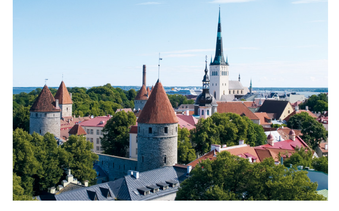
Tallinn, population 437,000, is the capital and largest city of Estonia.