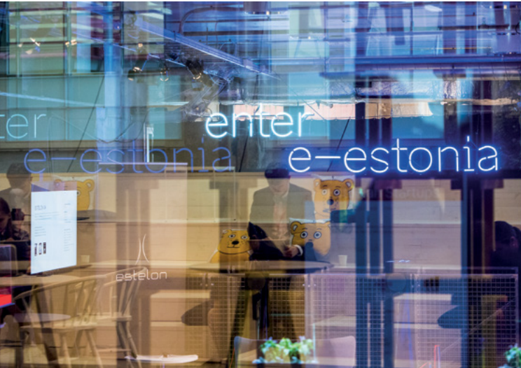
Estonia has gained international attention for its pioneering use of digital tools, including the launch of governing platform e-Estonia in 2012.

Estonia's transformation into a digital republic has also bolstered its tax system. While the governments of most countries are slowly digitizing records and transactions, Estonia jumped into e-government in the 2000s. With the launch of governing platform e-Estonia in 2012, the country began using secure technology that allows users to record data and transactions instantaneously. For tasks ranging from voting to getting a mobile ID to paying taxes, all that's required to interact with the government is an internet connection.