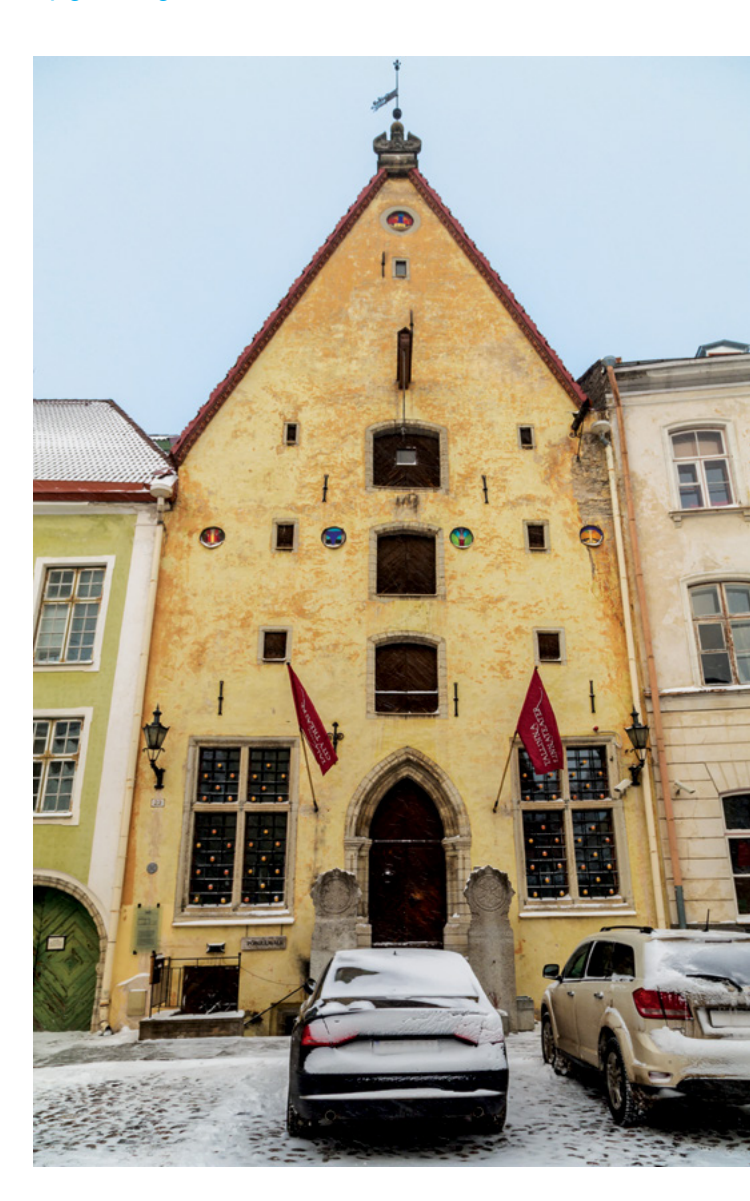
City officials have made many investments, including restoration of the historic Tallinn City Theatre complex.

The Tallinn metro area's economy now accounts for 64 percent of the country's GDP and 51 percent of employment.... The city has invested heavily in improving local parks, renovating schools, and upgrading infrastructure.