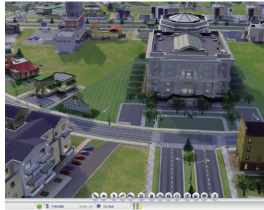
Left: Games like this one, designed by Amsterdam-based Play the City, can help city leaders make decisions. Right: A still from SimCity, a popular digital city-building simulation.