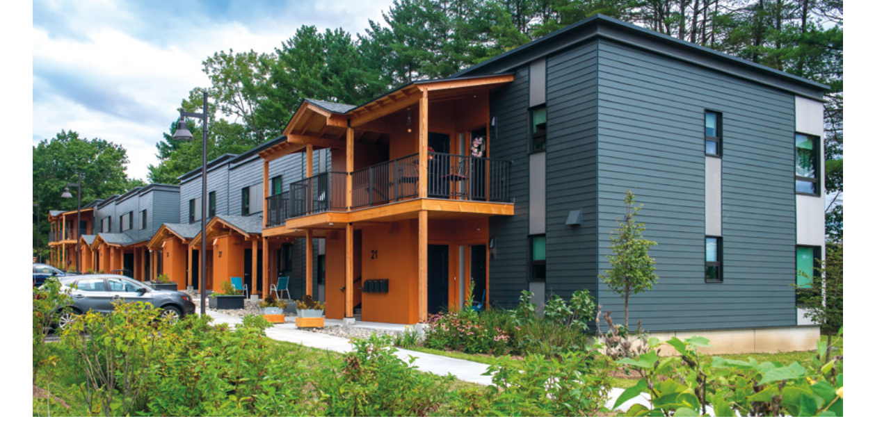
With funds including a bond administered by the Vermont Housing and Conservation Board, Twin Pines Housing Trust built an energy-efficient, mixed-income housing complex in White River Junction, Vermont, that includes community gardens and transit access.