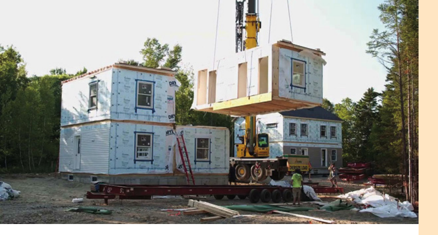
In coastal Maine, a land trust and community land trust (CLT) are partnering on a joint effort to protect wetlands and build affordable workforce housing.

had negative experiences with each other and may view the other as competitors."