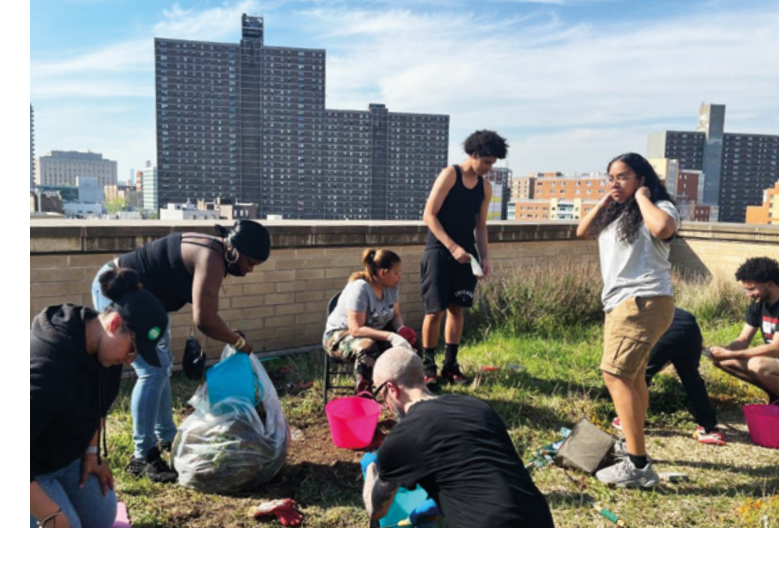
Volunteers with Nos Quedamos, a community development corporation in the South Bronx that recently launched a community land trust to promote affordable housing and sustainability.

In the South Bronx, New York, a community land trust launched in 2020 operates with a similar hybrid model, working to preserve housing affordability and protect open space, including the neighborhood's network of community gardens. The South Bronx Community Land and Resource Trust grew from the work of local community development corporation Nos Quedamos (We Stay), which started in the 1990s as grassroots resistance to an urban renewal plan that would have displaced a low-income, mostly Latino community. Committed to "development without displacement"development driven and controlled by the community—Nos Quedamos now has a portfolio of affordable housing. It launched the CLT to "create and support a healthier community by bringing into balance land use, affordability, accessibility to services and open space, environmental sustainability and resilience, community scale and character." It is designed to be a centralized, community-owned entity.