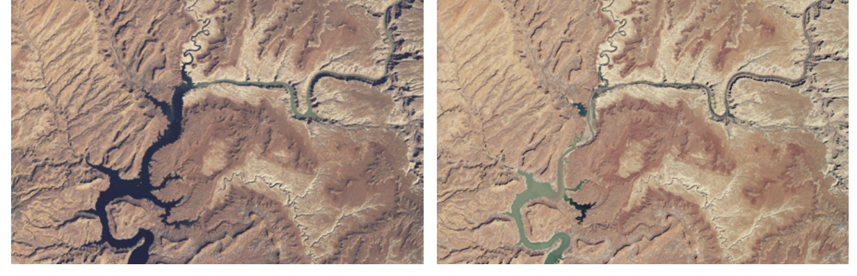
Satellite images reveal the decline in water levels in Lake Powell between 1999 (left) and 2017 (right).

authorizing studies to evaluate ambitious plans to "augment" the flow of the Colorado River through a number of approaches. Those included cloud seeding, desalination of both ocean water and saline groundwater, and "importing" water from other rivers—including an early attempt to target the Columbia River, more than 800 miles away in the Pacific Northwest, an idea that was swiftly beaten back by the Washington congressional delegation.