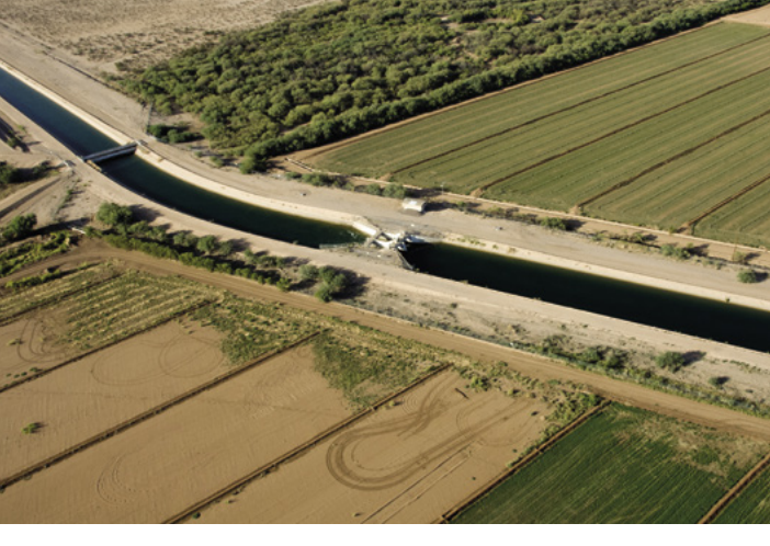
The Central Arizona Project cuts through farmland that relies on the complex irrigation system. Farmers in central Arizona would be among the first to face cuts under the proposed drought contingency plan.

The transfer of water from farms to cities, either temporarily or permanently, is an extremely controversial issue. Any discussion of the topic—especially in central Arizona, where farmers would be the first to have their water cut due to contractual agreements made well before the current negotiations began-quickly moves from technical talk of crop consumptive water-use coefficients to basic questions of social equity. "That's the crux of the problem: Do people