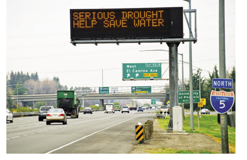
A California highway sign urges residents to conserve water. The 2007 shortage guidelines do not require California to reduce the amount of water it takes from the river; the proposed drought contingency plan would change that (see page 31).

The states' negotiators will not get much reprieve before they have to tackle the next round of even tougher questions: The provisions of both the 2007 shortage guidelines and the arduously