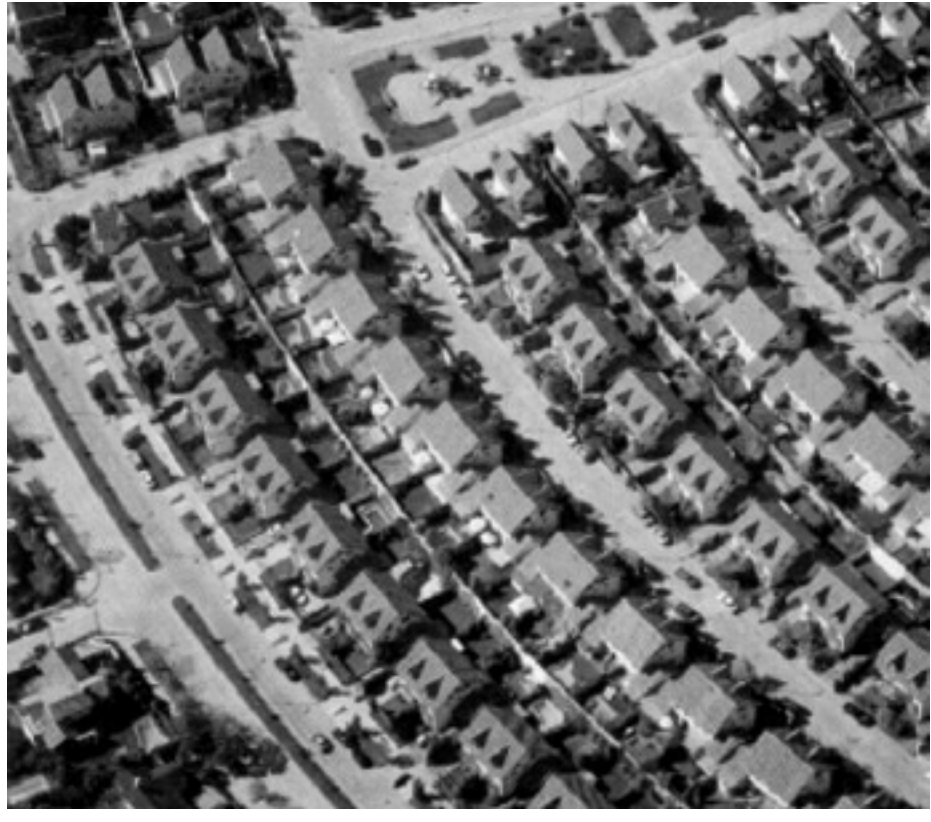
In Latin America, sprawling gated communities, such as this one in Santiago, Chile, have become the norm for a growing sector of the population.

Since the economic reforms of the early 1980s, many residential areas in Chinese cities have walls to improve security and define social status. Often these developments are designed by U.S. companies and based on U.S. planning and design standards. Private communities in Southeast Asia, such as in Indonesia, are marketed as places that allow the differentiation of lifestyle and give prestige and security to their inhabitants. In Latin America sprawling gated communities at the metropolitan