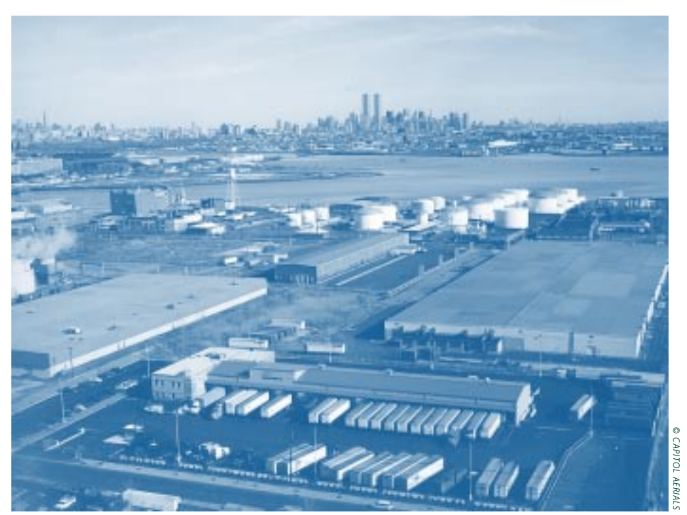
Daybreak Express (foreground) is one of several successful brownfield redevelopment projects in Newark.

from the incentive, and how municipalities should focus the program only to projects that really need such significant advantages.