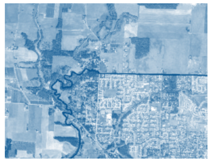
Development abuts the urban growth boundary just outside of Hillsboro, a suburb of Portland, Oregon.

1990s, Portland experienced a large increase in housing prices (approximately 60 percent compared to almost 20 percent in Atlanta, in nominal terms). Between the mid-1980s and the mid-1990s, homeownership rates in Portland increased by nearly 5 percent while Atlanta's rate remained virtually unchanged. Finally, perceptions of improved house quality were greater among Portland residents than those in Atlanta. In both metropolitan areas and in both time periods, the proportion of household income spent on housing was virtually the same, suggesting that income growth in Portland exceeded that in Atlanta. However, it is difficult to conclude definitively that increases in house quality in Portland were