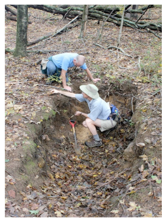
Figure 6: Participants in a field-based workshop at Yale-Myers Forest