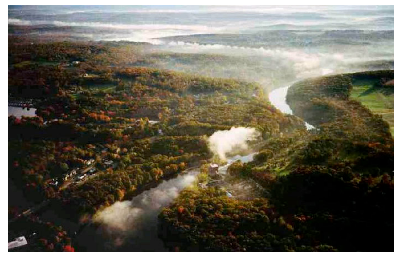
Figure 1: The Quiet Corner landscape—confluence of the Quinebaug and Shetucket Rivers