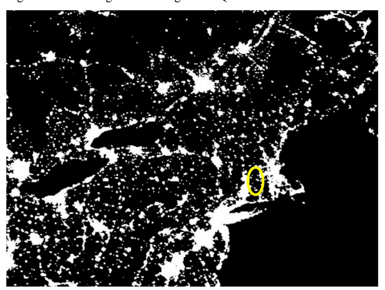
Figure 3: NASA night earth image—the Quiet Corner is the dark area circled

The region is rich with wildlife and healthy hardwood and coniferous forests. It is one of the last remaining intact forested landscapes in the corridor between Boston and Washington, and shows up as the dark spot in the night lights image (figure 3). These forests provide high value ecosystem services such as wildlife habitat, carbon sequestration, and clean water to downstream communities, including the University of Connecticut's main campus at Storrs.