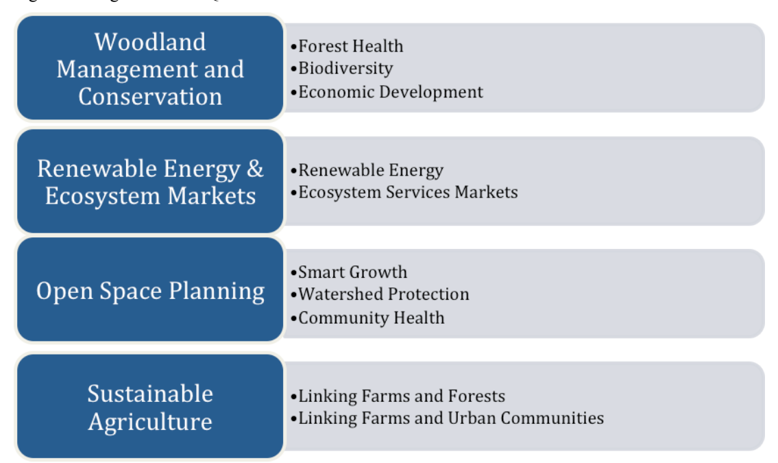
Figure 5: Programs of the Quiet Corner Initiative

The Yale-Myers Forest is ideally situated to become a hub of research and adaptive management to try out new ideas and foster expansion of the ones that work well. As both a rural and urban landowner, Yale is in a unique position to offer a comprehensive research facility and platform focused on biophysical, social and economic aspects of land conservation and adaptive management. This initiative will provide new education and research opportunities for Yale students and faculty as well as promote the visibility, strength and competitiveness of FES programs, attracting high quality students with a distinctive program not available elsewhere and offering new avenues for cultivating alumni and other financial support. It will also mobilize stakeholders in the Quiet Corner region of Connecticut for the benefit of the surrounding communities, bringing more resources to bear than would be otherwise possible. As part of the long range plan, these efforts can be expanded along the urban-rural continuum, in partnership with Yale FES's Hixon Center for Urban Ecology.