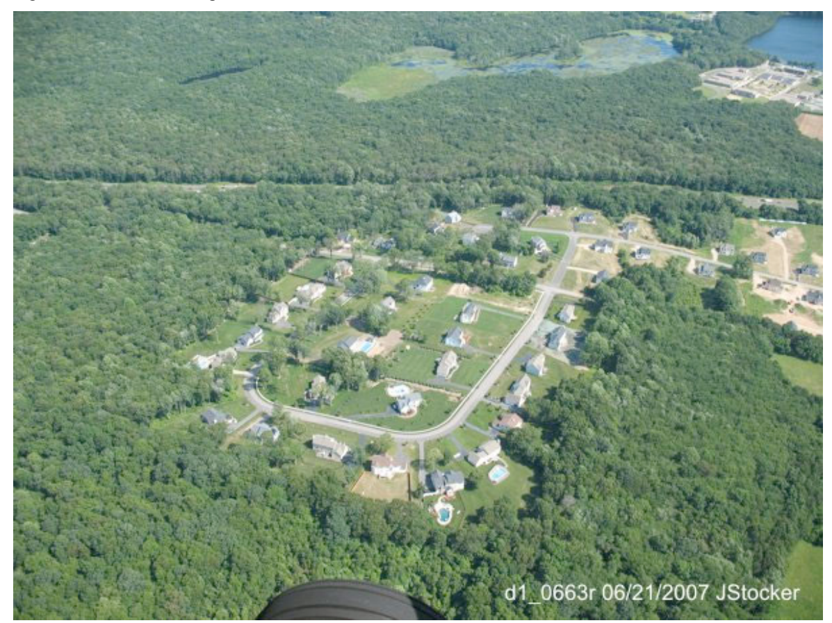
Figure 4: Suburban development in forestland in the Thames Watershed.

Highlands will remain intact or immune to development pressures, and therefore a number of conservation organizations have mobilized an effort to protect this region from development (MASSCONN 2012).