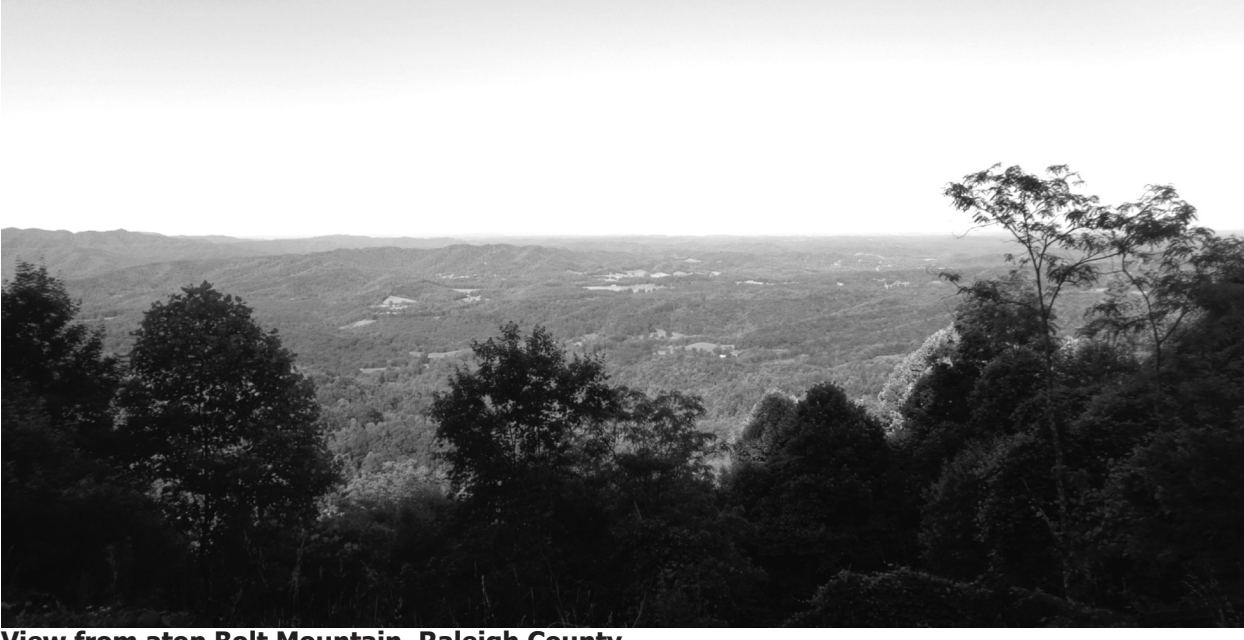
View from atop Bolt Mountain, Raleigh County Cover Photo: R. D. Bailey Lake, Wyoming County