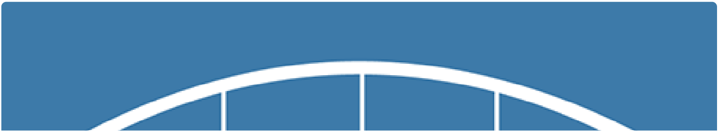
Ohio Business Gateway