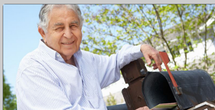
Check the Status of Your Senior Freeze