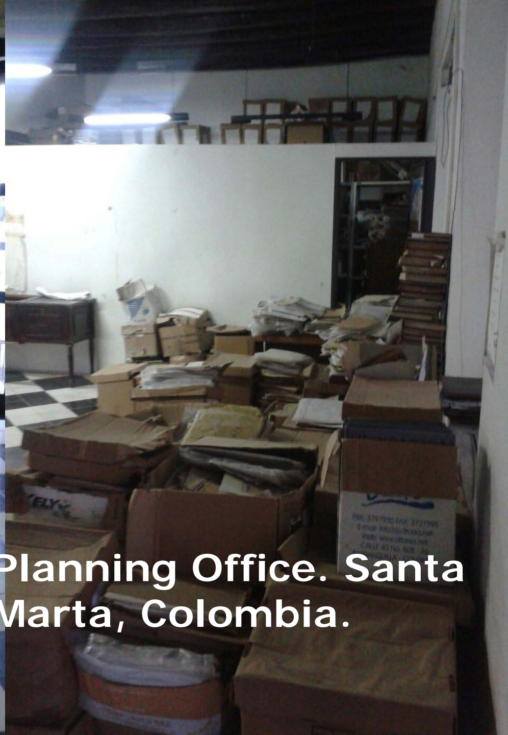
Planning Office. Santa Marta, Colombia.