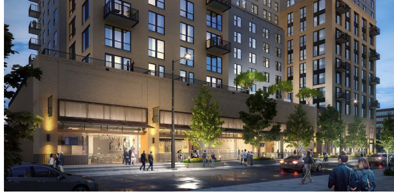
An artist's rendering of the 2020 Zocalo Community Development in Denver's River North neighborhood. Credit: Craine Architecture, Inc.

Building density in Mumbai, India, is limited by the floor space index (FSI)—the ratio of allowable floor space to the plot area. The city can then redirect development intensity by allowing property owners to sell or trade the rights to their unused FSI. 12 Mumbai also enables the sale of development rights, allowing developers to purchase up to a specific amount of additional FSI from the government, to generate public revenues to fund urban infrastructure.