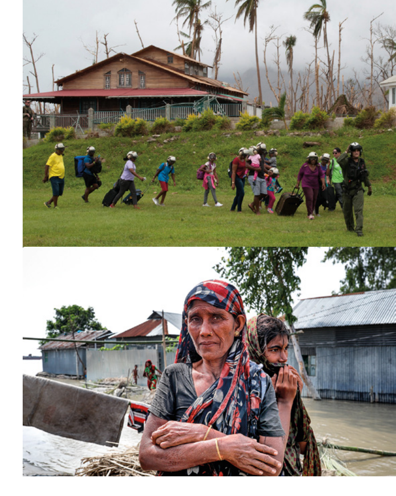
Evacuees from Hurricane Maria in Dominica in 2017, top, and from flooding in Bangladesh in 2019, bottom.

Land will be required to resettle people displaced by flooding, extreme weather, and climatic shifts that render currently inhabited areas no longer hospitable. We know the climate and weather extremes that are already driving displacement will escalate. The World Bank estimates that more than 200 million people will be forced from their homes by climate change in Asia, Africa, and Latin America in the next few decades, and millions more will be affected in other regions. This climate-induced dislocation and involuntary migration will amplify existing stressors such as conflict, food and water insecurity, poverty, and loss of livelihoods from economic or environmental pressures (IPCC WGII 2022).