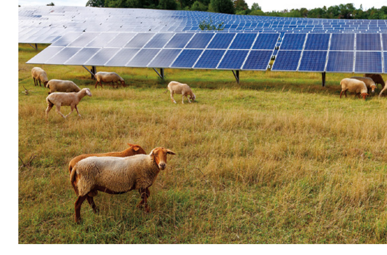
Sheep and solar panels share space on a farm in Germany.

Despite the threats that climate change poses to natural carbon absorption, it is increasingly held out as an alternative to