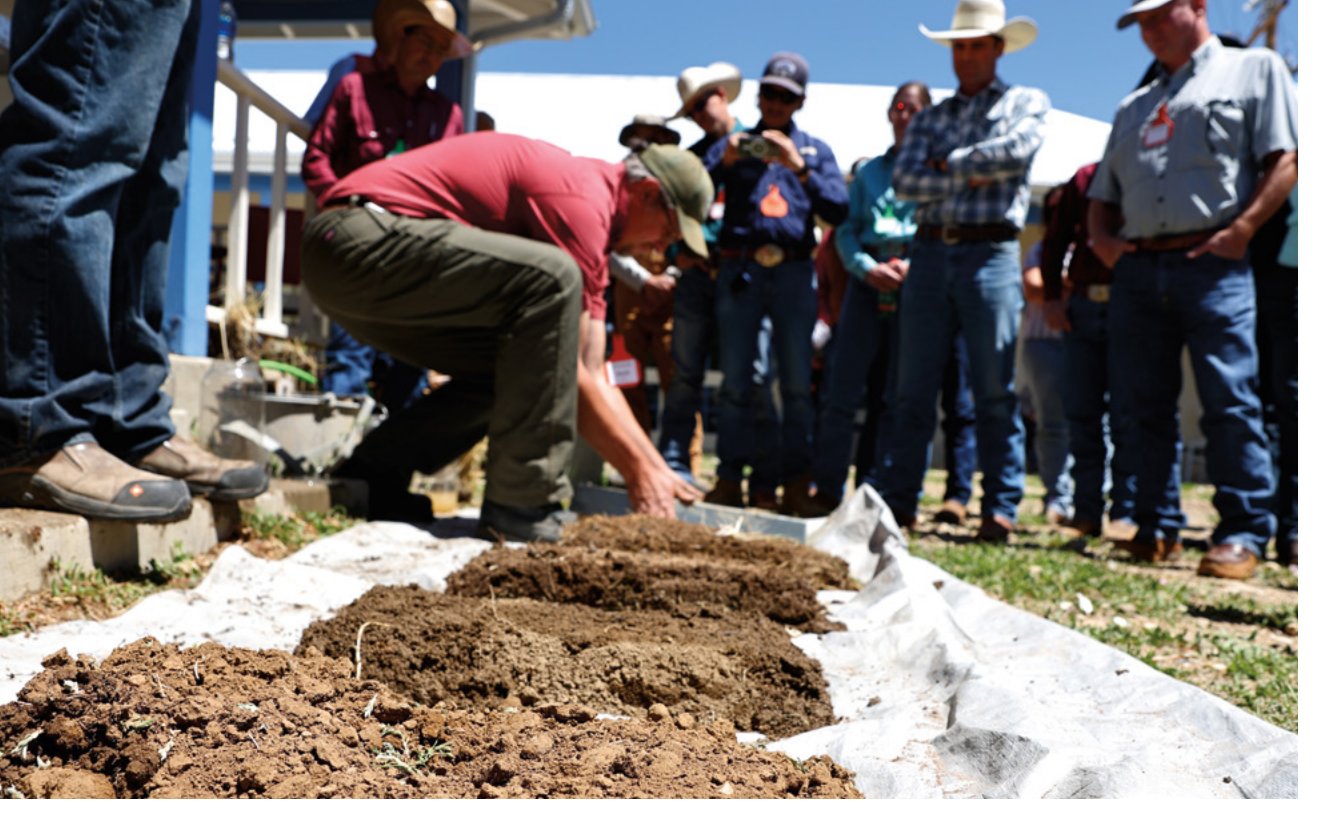
Ranchers attend a regenerative agriculture workshop in Cimarron, New Mexico.

able assumptions of equivalence (among distinct bits of natural capital) or of fungibility (between natural resources and technical alternatives), and about policy regimes that privilege the idea of net economic welfare to rationalize probable casualties of distribution or outright injuries to human rights and justice.