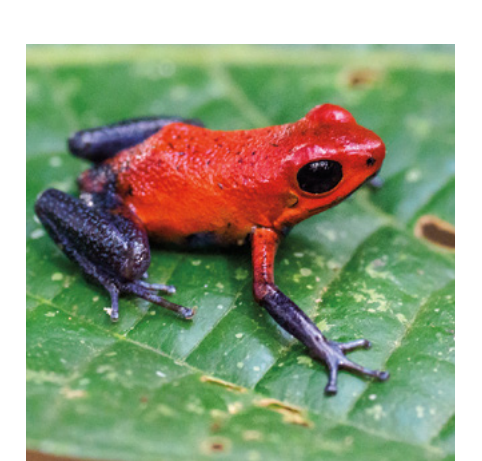
The strawberry poison dart frog, a species found in Central America.

Sustaining the natural ecosystems on which human survival depends... ultimately will rest on our ability to reduce and reverse our appropriation and fragmentation of natural habitat.