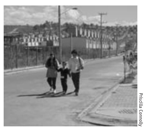
Mass-produced formal housing similar to this development called Buenaventura is being built on the periphery of many Mexican cities.

In Brazil, municipal governments have begun to experiment with ways to regulate land use, such as property tax increases