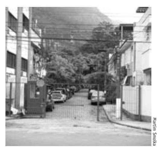
Gated neighborhoods are increasingly common in Rio de Janeiro and other cities throughout the world.

Forced to respond to these kinds of problems, city governments contemplate new approaches to such questions as local versus national authority, productive efficiency versus neighborhood-based redistribution of services, and conflicts between plans and markets. At the municipal level the complications become painfully clear. Popular advocates of redistributive reforms struggle to survive in a hostile environment, often against strong private business interests, a privileged middle class, and conservative provincial and central governments. The problems in cities are immediate and concrete, requiring negotiation, concessions, compliance with an often-biased legal framework, and high degree of profession-