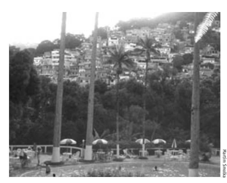
Informal housing rises on environmentally sensitive hillsides above a resort pool near Rio de Janeiro.

ful national forces). They may act to support economic growth or to redistribute it, even in a conservative provincial or national climate. Local planning does constrain land markets, but often without redistributive effects, since city governments must contend with strong financial interests, patterns of privilege, and entrenched power. Professional competency and consistency are required to exploit the full potential of property registration and taxation systems, and financial decentralization limits the possibility of cross subsidies and redistributive measures.