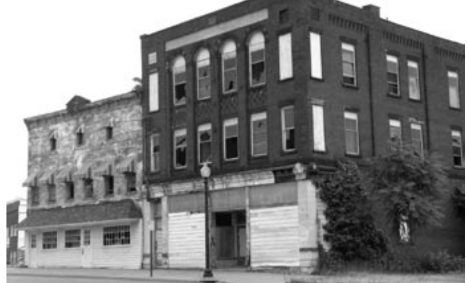
Even small cities, such as Alliance, Ohio, have their share of abandoned buildings.

Comparable data on vacancy and abandonment across cities are difficult to obtain and vary widely due to different definitions and gaps in data sources, particularly in commercial and industrial land uses. Estimates of the amount of abandoned housing stock range from 4 to 6 percent in "declining" cities to 10 percent or more in "seriously distressed" cities (Mallach 2002). The following city statistics from Census 2000 data and city records only