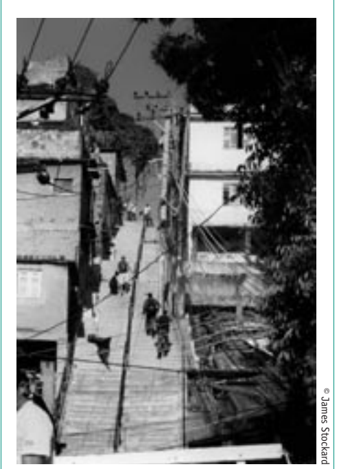
Stairway to the Providência Hill favela in Rio de Janeiro.

In addition to the crime-fighting programs, the mayor sought to improve the physical and social environment of the favelas. Citizens received training and free