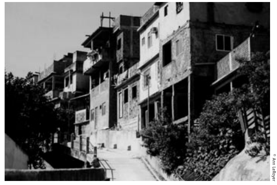
Additional stories have been added to these houses as part of Rio's Favela-Bairro project.

helped to steady the economy over the last few years, the country is still saddled with considerable foreign debt. Faced with the challenges of extreme poverty, drug trafficking, crime, inequitable land distribution, and inadequate housing, the government has limited funds for social programs and often has used them inefficiently.