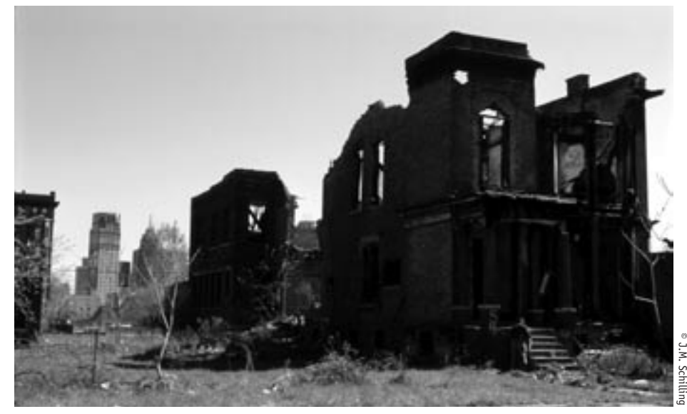
Detroit, like many cities, has been hit hard by vacant properties for many years.

An increasingly popular tool is the local land bank, a governmental entity that acquires, holds, and manages vacant, abandoned, and tax-delinquent property. The properties are acquired primarily through tax foreclosure, and then the land bank develops or, more likely, holds and manages the properties until a new use or owner is identified. Land banks can provide marketable title to properties previously encumbered with liens and complicated