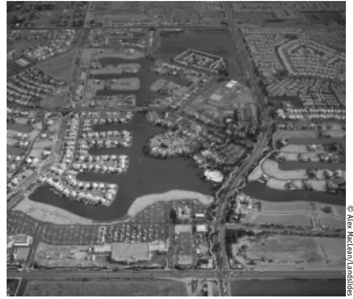
Subdivision, Phoenix, Arizona

of this initiative are still being debated, it sends a strong message to planners in a state that has had one of the most progressive land use and growth management programs for 25 years. The message, according to Oregon's state planner, is to not rest on your successes, and to keep citizens and communities engaged in an ongoing discussion about the effectiveness of land use planning. He also stressed the need to balance preservation with appropriate development, emphasizing that "good planning doesn't just place limits on growth and development."