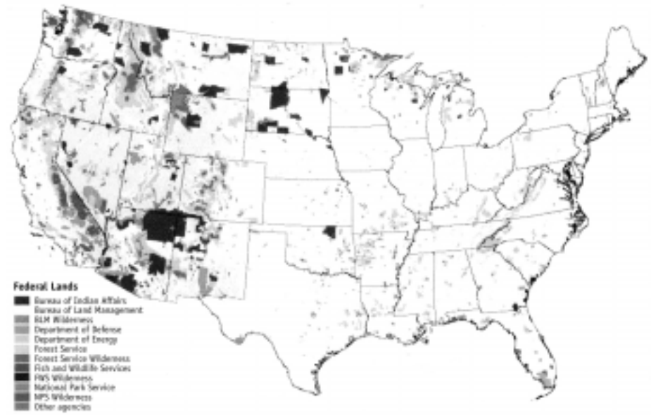
FIGURE 1 Federal Government Lands in the U.S.