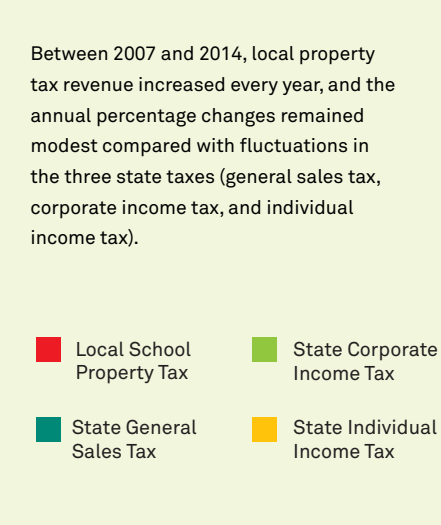
Figure 2 Annual Percentage Change in U.S. Tax Revenue

In 31 states, 2013–14 state education aid per student was lower than in 2007–08 after adjusting for inflation, according to a survey conducted by the Center on Budget and Policy Priorities.<sup>4</sup> These state aid reductions averaged 9.6 percent. Initially cuts in state aid resulted from state legislative responses to sharp reductions in state tax revenue resulting from the Great Recession. More recently, state aid cuts resulted when legislatures and governors in some states decided to cut state income taxes.